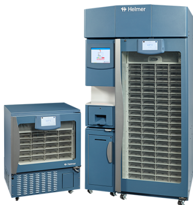
Works with HaemoBank devices

BloodTrack Just-in-time Blood Management System quickly allocates the right blood product to the right patient where and when it's needed, eliminating the need to crossmatch and label blood products in advance and reducing blood bank and clinical staff workload. The software is designed to work with the BloodTrack HaemoBank, creating a virtual 24/7 automated transfusion service.