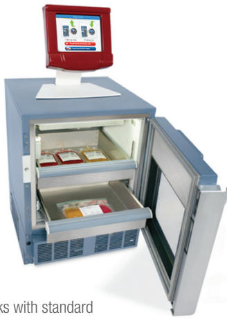
Works with standard refrigerators or HaemoBank® devices

Providing safe, secure and fully traceable blood product storage