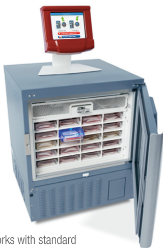
Works with standard refrigerators or HaemoBank devices

The BloodTrack Emergency Blood Management System controls, tracks and monitors access to emergency blood products, including Massive Transfusion Protocol (MTP) packs, in the emergency department, trauma area or outpatient surgical center by securing new or existing storage devices with software-controlled electromagnetic locks. This provides your authorized caregivers with safe, fast access to life-saving blood products where and when they are needed most.